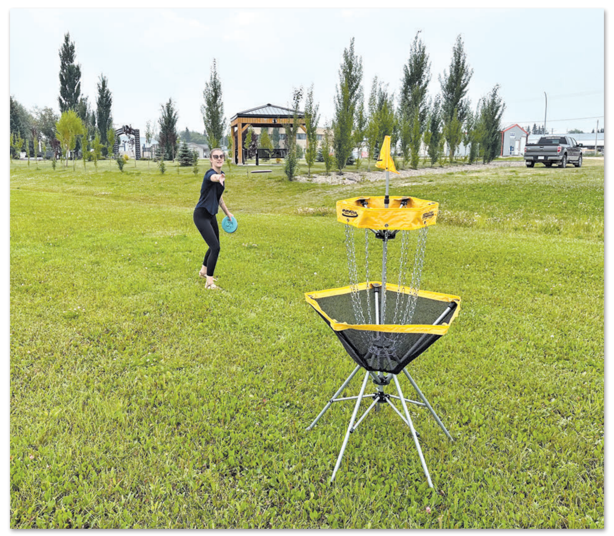
With the help of grant funding, Spiritwood's SAD SAAC Park is now home to a five-hole disc golf course.