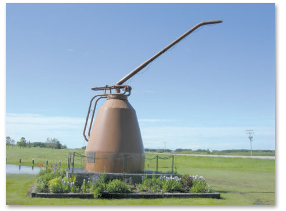
Fifty years after it was erected in honour of Ernie Symons, the 23-foot Symons oil can monument still stands in Rocanville, Sask.