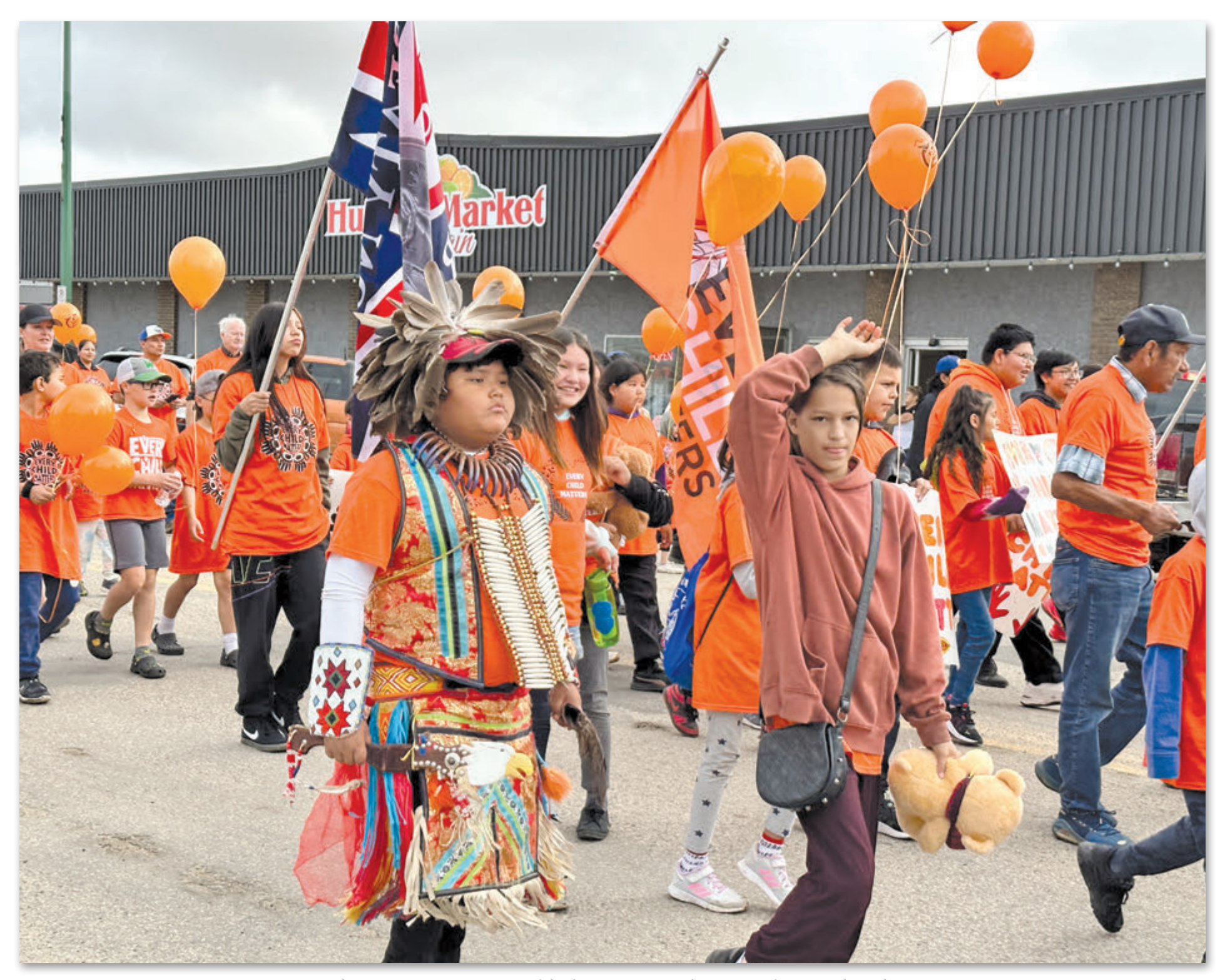
A large crowd turned out to take part in the truth and reconciliation walk, putting on an impressive display of orange.