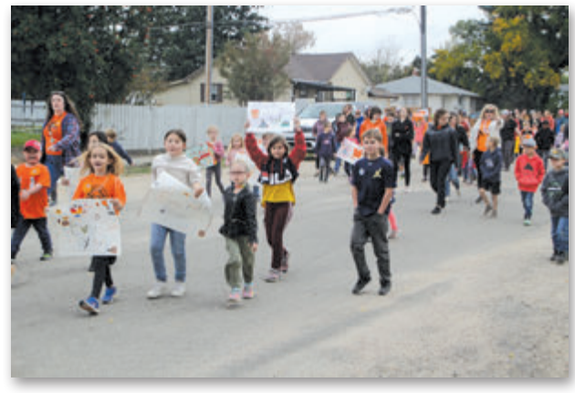
Children made signs to display throughout the Honour Walk.