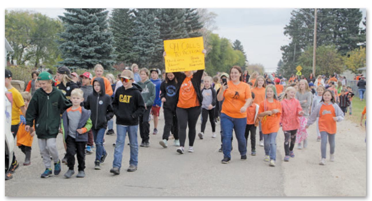
The Honour Walk saw a large procession make its way up and down Shellbrook's Main Street.

"Just looking around and watching everybody with their hats off, respecting the drum and why we're here... It was amazing to see everybody come together," Erb said.