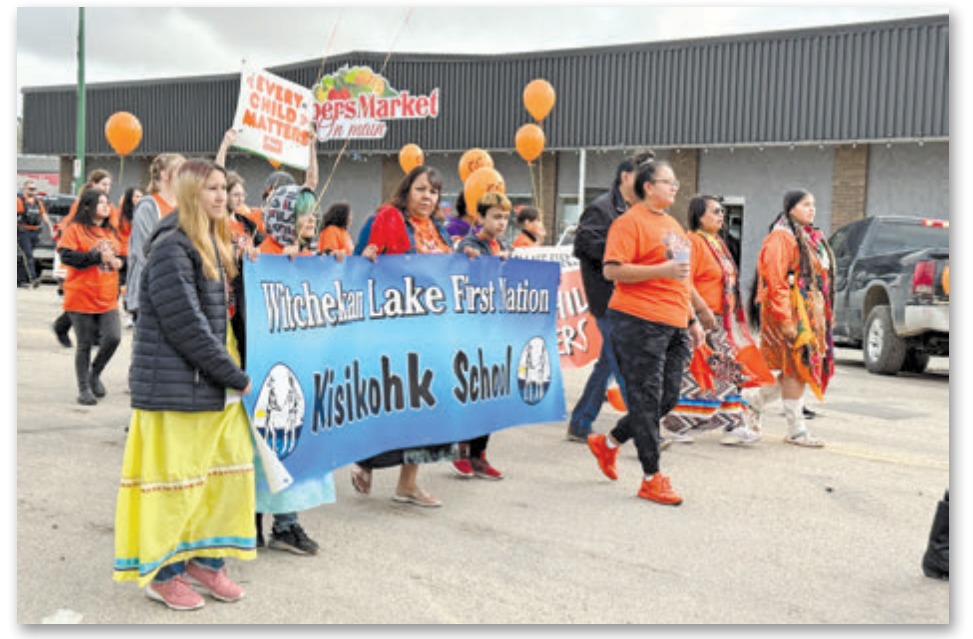
Witchekan Lake's Kisikohk School brought a large contingent of youth representatives to take part in the walk.