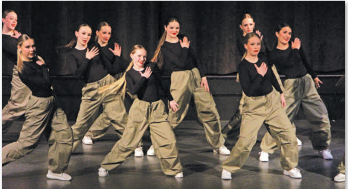
A high-energy senior hip hop group number closed out the Mini Showcase.