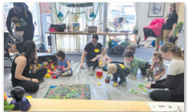
Regional KidsFirst from Prince Albert came to Spiritwood Library on Friday, March 1, for some fun themed Early Learning. With lots of activities to choose from, the children were kept hopping with some Easter games and painting, ring toss, and the highlight of the morning: the big parachute game. With songs to start and end with, the morning was completed with all types of literacy and social interaction.

For over the past four decades The Saskatchewan Weekly Newspapers Association, in partnership with SaskPower and the Lieutenant Governor of Saskatchewan, have recognized the youth of Saskatchewan through the Junior Citizen of the Year Award.